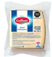
PARMESANO GALBANI EN CUÑA 900G