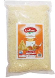
PARMESANO RALLADO GALBANI 1KG Price: $418.00