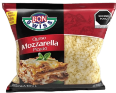
MOZZARELLA RALLADO BON SWISS 500G Price: $714.68