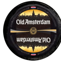
QUESO OLD AMSTERDAM