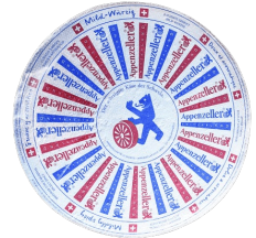
QUESO APPENZELLE R