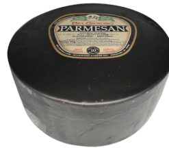
QUESO PARMESANO CERA NEGRA