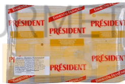
EMMENTAL PR SIDENT 3KG