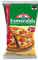
PIZZERO 3 QUESOS ESMERALDA 1.8KG Price: $491.90