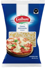
PIZZERO MOZZARELLA PICADO GALBANI 2.27KG Price: $436.50