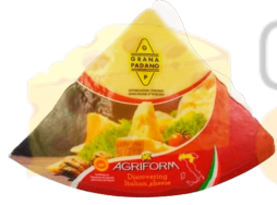
QUESO GRANA PADANO