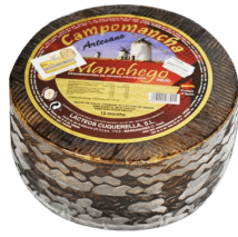
QUESO MANCHEGO CURADO 12 MESES