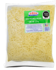
QUESO MOZZARELLA RAYADO