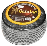
QUESO IBÉRICO DE 3 LECHES SEMICURADO