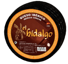
QUESO IBÉRICO DE 3 LECHES CURADO