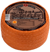
MANCHEGO SEMICURADO DON BERNARDO