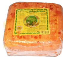
QUESO MAHÓN MENORCA