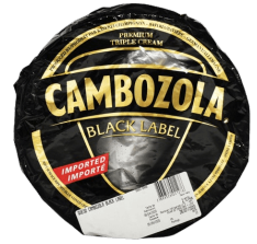
QUESO CAMBOZOLA BLACK LABEL Price: $1,900.50