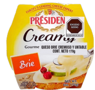
BRIE UNTABLE PRÉSIDENT 170G Price: $111.50