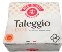
QUESO TALEGGIO Price: $1,422.90