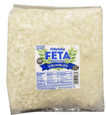
QUESO FETA DESMIGADO