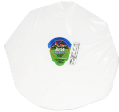
QUESO BRIE Price: $1,467.00