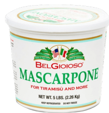
QUESO MASCARPONE EN CUBETA