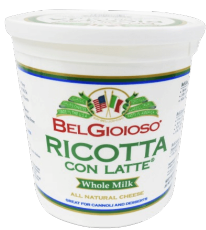
QUESO RICOTTA EN CUBETA