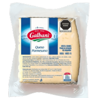
PARMESANO GALBANI EN CUÑA 900G