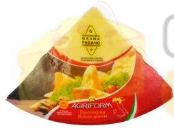
QUESO GRANA PADANO