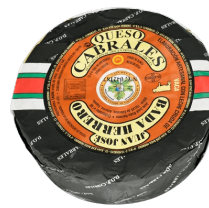
QUESO CABRALES Price: $4,115.85