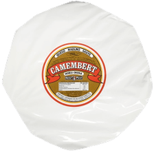
QUESO CAMEMBERT Price: $1,467.00