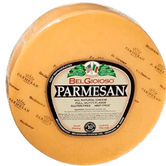
PARMESANO BELGIOIOSO RUEDA 10KG