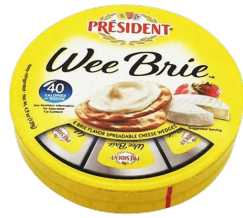
CREMA DE QUESO BRIE PRÉSIDENT 139G Price: $109.00