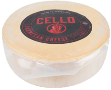
PARMESANO RISERVA 12 MESES