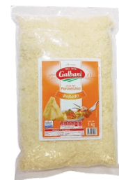
PARMESANO RALLADO GALBANI 1KG Price: $418.00