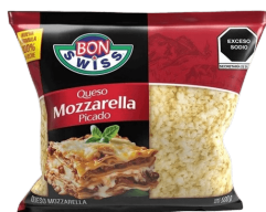
MOZZARELLA RALLADO BON SWISS 500G Price: $714.68