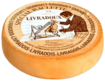
QUESO RACLETTE FRANCÉS