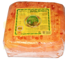
QUESO MAHÓN MENORCA