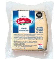
PARMESANO GALBANI EN CUÑA 900G