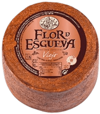
FLOR DE ESCUEVA 1.1KG Price: $1,405.00