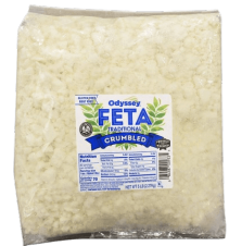
QUESO FETA DESMIGADO