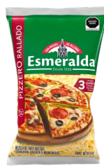
PIZZERO 3 QUESOS ESMERALDA 1.8KG Price: $491.90