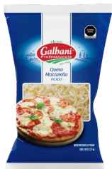
PIZZERO MOZZARELLA PICADO GALBANI 2.27KG Price: $436.50