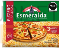
PIZZERO 3 QUESOS ESMERALDA 350G Price: $95.50