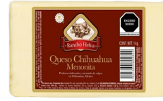
CHIHUAHUA MENONITA RANCHO HELVIA 1KG