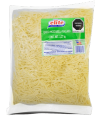
QUESO MOZZARELLA RAYADO