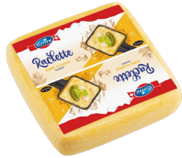
QUESO RACLETTE SUIZO