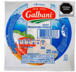
MOZZARELLA FRESCO GALBANI 226G Price: $140.60