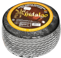
QUESO IBÉRICO DE 3 LECHES SEMICURADO