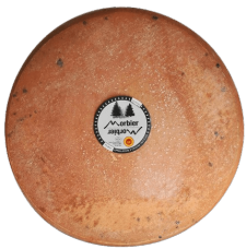
QUESO MORBIER TRADITION ÉMOTION