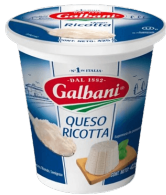
RICOTTA GALBANI 425G Price: $152.60