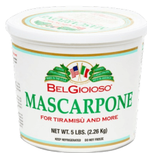
QUESO MASCARPONE EN CUBETA