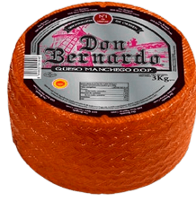
MANCHEGO CURADO DON BERNARDO