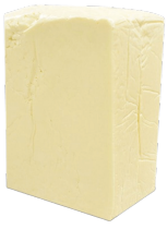
QUESO MONTEREY JACK