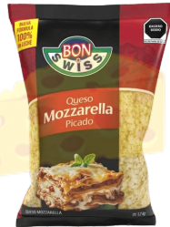
MOZZARELLA RALLADO BON SWISS 1.2KG Price: $2,335.48