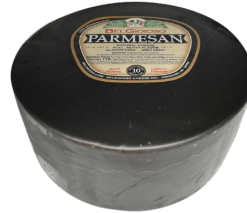
QUESO PARMESANO CERA NEGRA