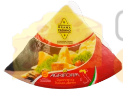
QUESO GRANA PADANO