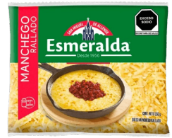
MANCHEGO RALLADO ESMERALDA 350G Price: $107.90