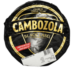
QUESO CAMBOZOLA BLACK LABEL