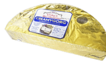
GORGONZOL A DULCE CREAMY GORG