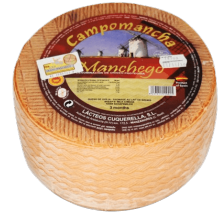
QUESO MANCHEGO CURADO 3 MESES