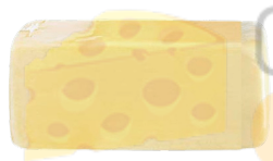
GOUDA BARRA LACTALIS 3.3KG Price: $634.50