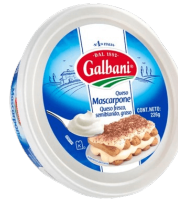
MASCARPONE GALBANI 226G Price: $123.70