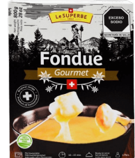
FONDUE DE QUESO SUIZO 800G