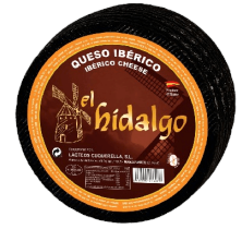
QUESO IBÉRICO DE 3 LECHES CURADO