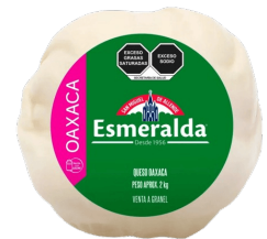
OAXACA ESMERALDA 2KG Price: $616.50