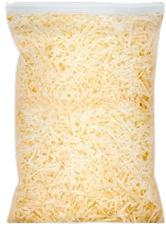
MOZZARELLA RALLADO LACTALIS 2KG