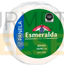
PANELA ESMERALDA 2.4KG Price: $543.60