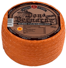
MANCHEGO SEMICURADO DON BERNARDO