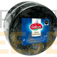
PARMESANO GALBANI 7KG