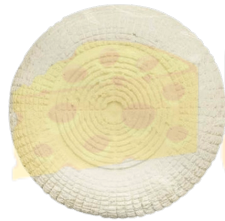
PANELA LACTALIS 2.4KG Price: $527.20