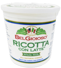
QUESO RICOTTA EN CUBETA