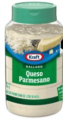
PARMESANO RALLADO KRAFT 453G