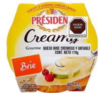
BRIE UNTABLE PRÉSIDENT 170G