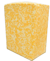
QUESO MARBLED JACK