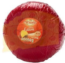
EDAM PRÉSIDENT BOLA 1.9KG