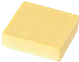
GOUDA EN BLOQUE LACTALIS 9KG