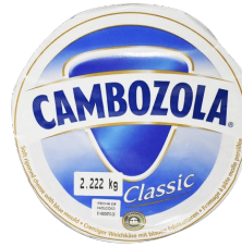
QUESO CAMBOZOLA CLÁSICO