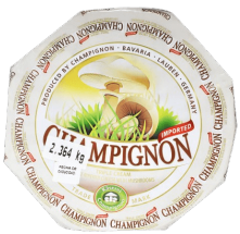
BRIE CHAMPIGNO N