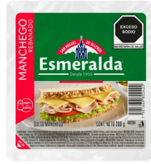
MANCHEGO REBANADO ESMERALDA 200G Price: $64.70