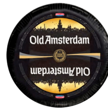
QUESO OLD AMSTERDAM