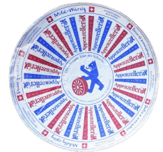
QUESO APPENZELLE R