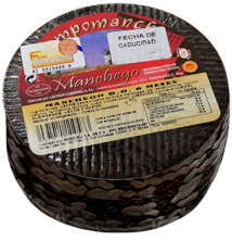
QUESO MANCHEGO CURADO 6 MESES