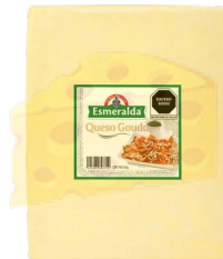
GOUDA BLOQUE ESMERALDA 10KG