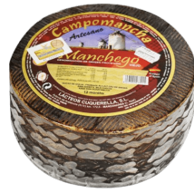
QUESO MANCHEGO CURADO 12 MESES